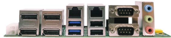
▲ I/O view