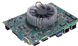
▲ Assembly View