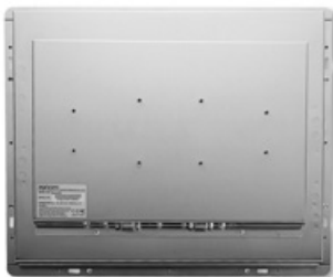
Back mounting holes