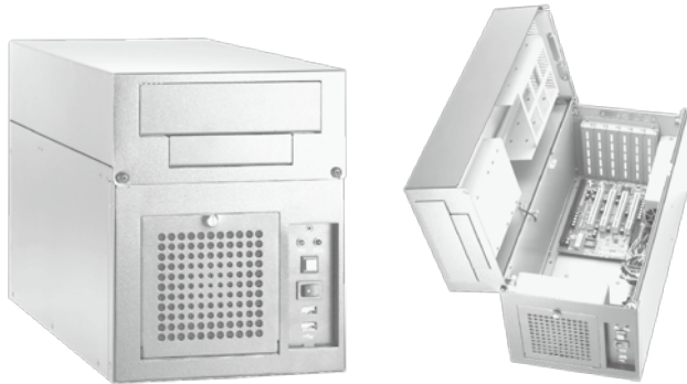
Flexible drive bay design for ease of maintenance