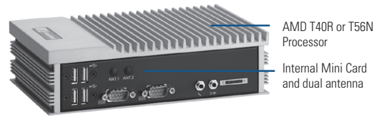
▲ Front view