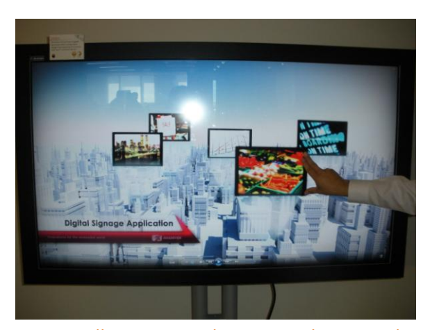
Figure 1: Intelligent e-Board system with Axiomtek OPS870 digital signage player

What is the most useful e-Board in the world? This e-Board should be equipped with large size LCD and the highest performance CPU. Powered by the 3rd Generation Intel® Core processor, Axiomtek's OPS digital signage player, OPS870, combines 31.5-inch OPS interactive touch screen LCD: Axiomtek OFP321; the complete system supports industrial grade LCD with high sensibility touch technology as well as excellent computing power. This intelligent e-Board system can maximize students' learning experience and also it is great for corporate staffs' collaborative meeting.