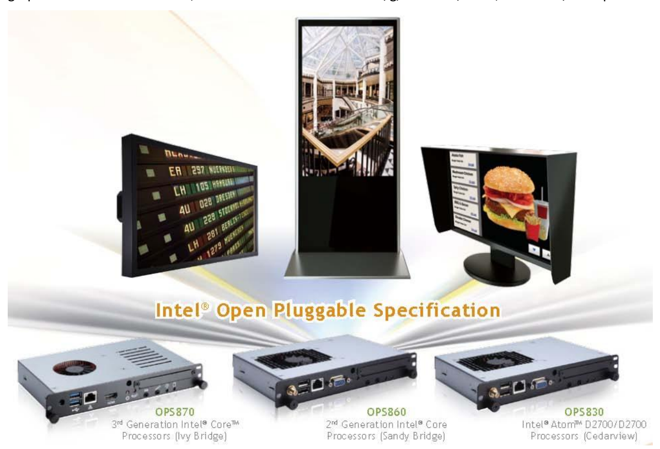
Figure 2: Axiomtek's comprehensive OPS digital signage products (OPS870, OPS860, OPS830 series)

significantly provides superb graphics performance, full HD content playback, and dual display presentations. Equipped with the OPS870, users can apply a variety of DOOH (Digital Out Of Home) applications with ease! The OPS870, is connected to displays via a standardized JAE TX-25 plug connector, and includes HDMI, Display Port, UART, and USB 3.0 signals. Pluggable HDD tray and DRAM are for quick and easy installation. The OPS870 digital signage player also supports one 10/100/1000Mbps Ethernet and USB 3.0 port to enable fast and efficient data computation and communication. One PCI Express Mini Card slot is equipped for graphics-enhanced video card, wireless LAN card for 802.11 b/g/n and 3G/GPRS, and tuner/AV capture card.