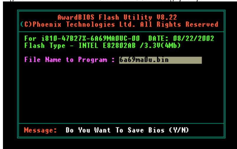
Figure 2-2 Do You Want to Save the BIOS? message prompt