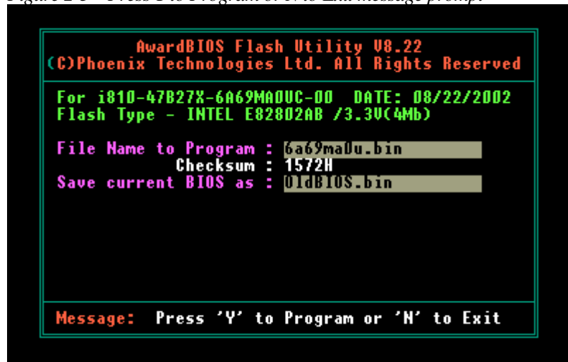
Figure 2-3 Press Y to Program or N to Exit message prompt

This saves your old BIOS in a file as you named it in the default drive and directory (in this example, on the A:\ drive). The program then prompts you to Press 'Y' to Program or 'N' to Exit? (Y/N). Refer to the following figure.