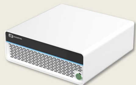
mBOX600 Medical-grade 4K Edge System